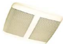
QTR080 & 110